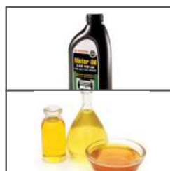
Used Motor & Cooking Oil