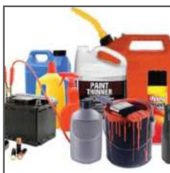
Household Hazardous Waste

Residents can bring the following items such as these illustrated here to any of the four Mecklenburg County Full-Service Disposal & Recycling Centers