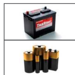
Batteries (Including car batteries)

For more information, please visit WipeOutWaste.com , or call our automated, 24-hr line 980.314.DUMP (3867) or 311.