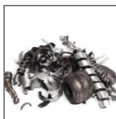
Scrap Metal & Auto Parts