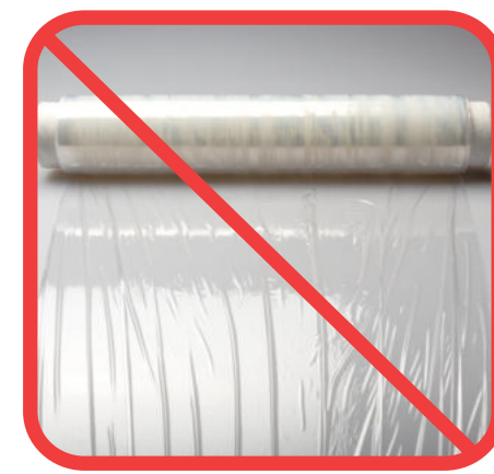
PLASTIC FILM & BUBBLE WRAP