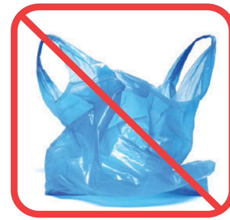
PLASTIC GROCERY BAGS