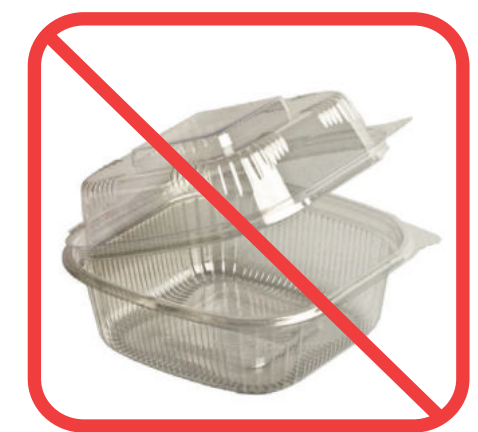
PLASTIC FOOD CONTAINERS