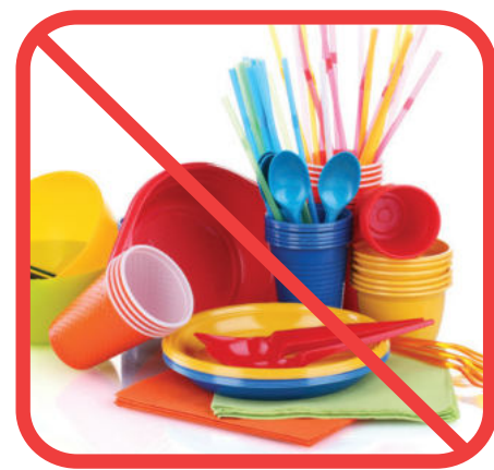
PLASTIC CUPS & PLASTICWEAR