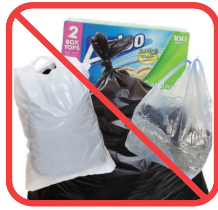
PLASTIC BAGS & TRASH