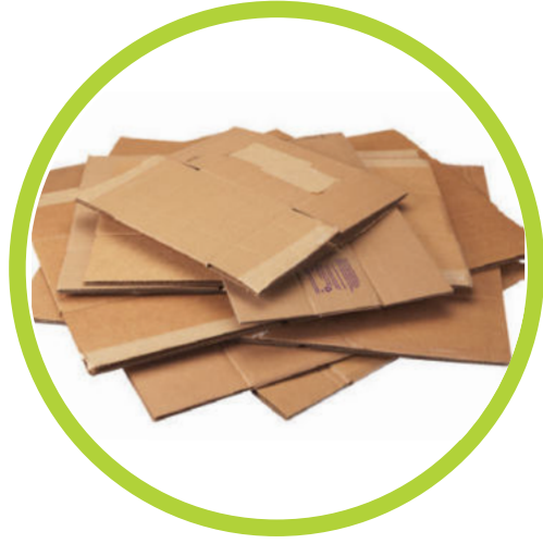
CARDBOARD BOXES (flattened)