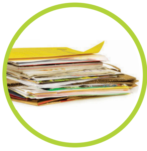
PAPER (brown bags, high-grade paper)