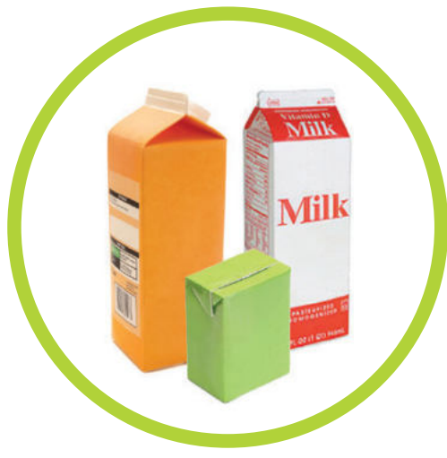
CARTONS & JUICE BOXES