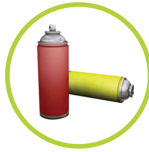
EMPTY AEROSOL CANS