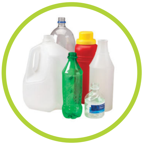
PLASTIC CONTAINERS (with necks only)