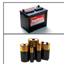
Batteries (Including car batteries)

For more information, please visit WipeOutWaste.com , or call our automated, 24-hr line 980.314.DUMP (3867) or 311.