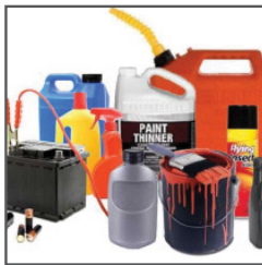
Household Hazardous Waste

Residents can bring the following items such as these illustrated here to any of the four Mecklenburg County Full-Service Disposal & Recycling Centers