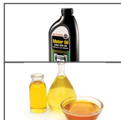
Used Motor & Cooking Oil