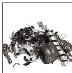
Scrap Metal & Auto Parts