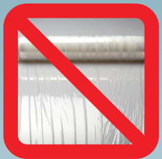
Plastic Film & Bubble Wrap