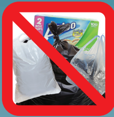
Plastic Bags and Trash