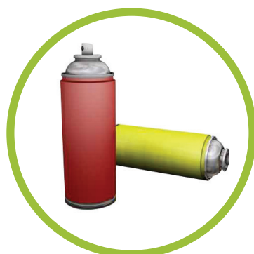
EMPTY AEROSOL CANS