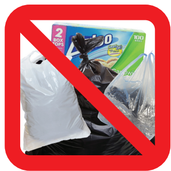
PLASTIC BAGS AND TRASH