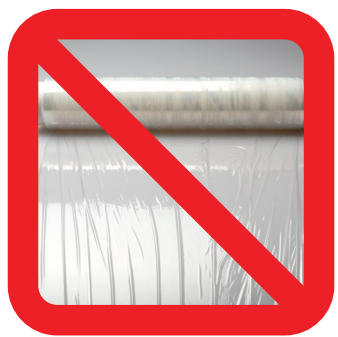
PLASTIC FILM & BUBBLE WRAP