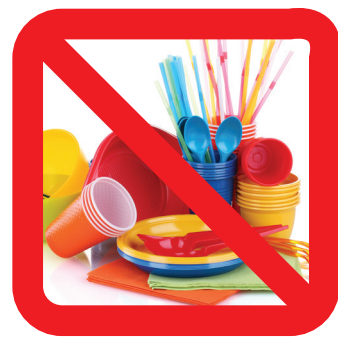
PLASTIC CUPS & PLASTICWARE