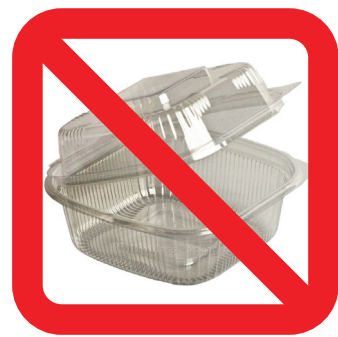
PLASTIC FOOD CONTAINERS