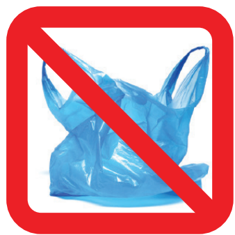
PLASTIC GROCERY BAGS