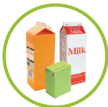
CARTONS & JUICE BOXES