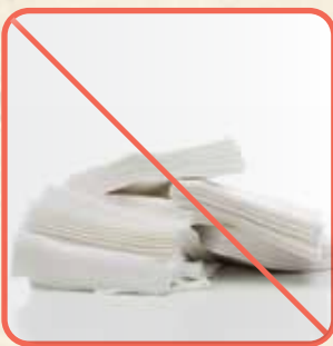
Napkins or Paper Towels

Make sure the items shown below DO NOT go into the recycle bin