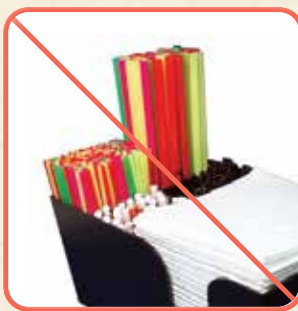
Plastic Straws & Stir Straws